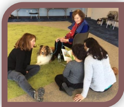
“Tail Wagging Readers” is always a popular day at the library! (Jan 28)