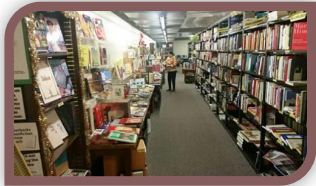
January's book sale brought in over $10,000.